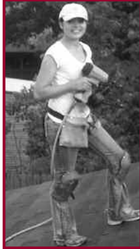
IRT construction volunteer in Mississippi