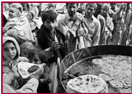
Internally Displaced Persons (IDP's) in Pakistan