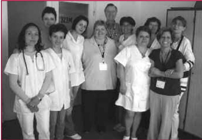
Project "Healthy Baby" in Romania.