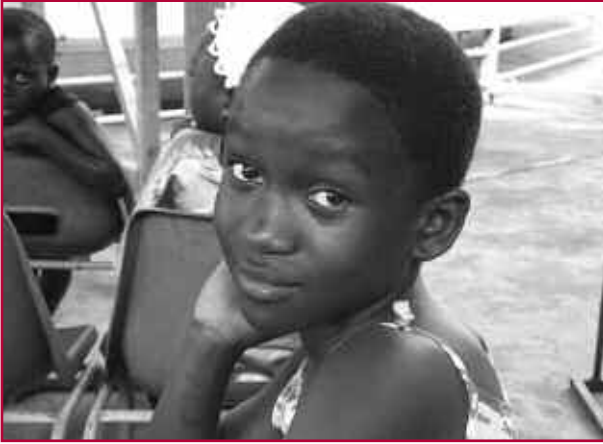
Young girl living with AIDS in Kampala, Uganda

D uring its more than 20 year history, Alternative Gifts International (AGI), a nonprofit corporation, has raised millions of dollars to support people in crisis, worldwide. Through an annual catalog of international development and relief projects, AGI raises funds for global gifts through its "Alternative Gifts Markets" held nationwide as well as in England, Holland, Japan and Korea. Designated grants are then sent to established international projects of several nonprofit agencies with excellent reputations and track records for relief and development.