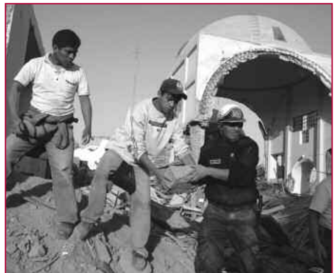
Peruvians remove debris after a major earthquake strikes Peru.