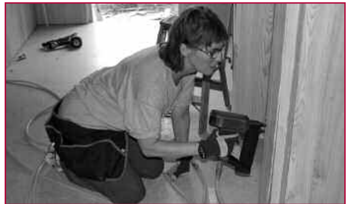
IRT volunteer helps repair home of Hurricane Katrina victims.