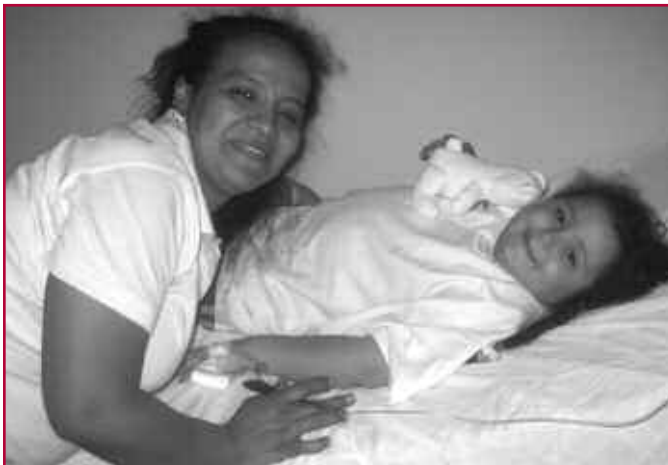
Young patient and her mother in hospital in Honduras.