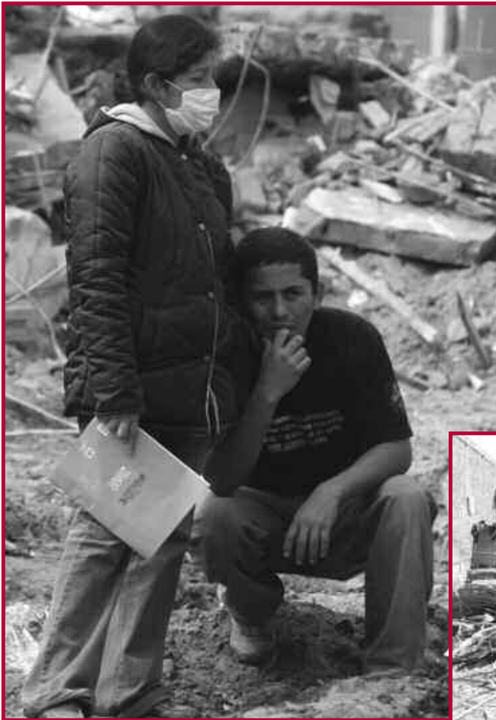
Powerful earthquake in Peru leaves chaos & homelessness.

The recent 8.0 magnitude earthquake that struck the coastal communities of Peru caused more than 500 deaths and destroyed over 34,000 homes leaving countless families without shelter and exposed to the elements. With the onset of the Peruvian winter, adequate shelter is crucial to preventing the outbreak of disease especially in the stricken areas where health and sanitation services have already been severely disrupted.